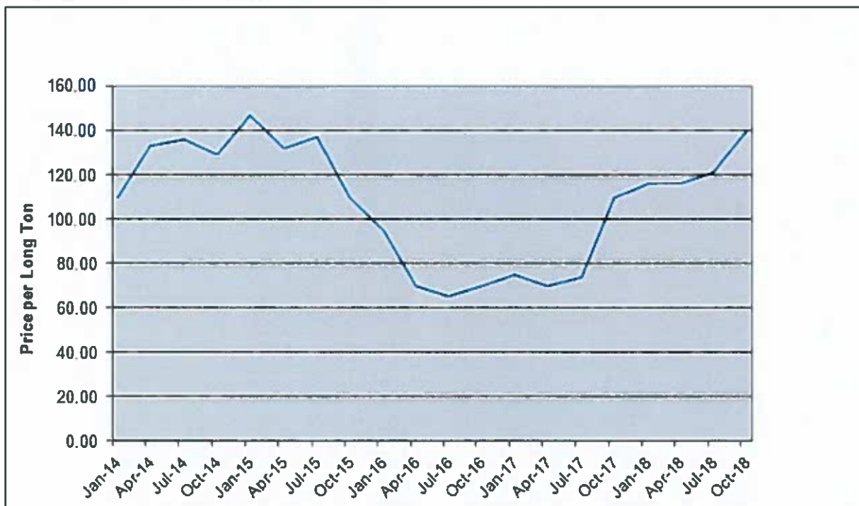
Green Markets Tampa Sulfur Index

Additionally, Chemtrade is captive to our sole carrier in the New Mexico market and our contracted rates. Unfortunately, we continue to see significant increases year over year in our freight costs.